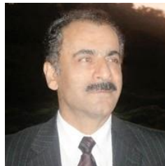
Mohammad Kondri Commissioner Consulate General of Canada in Los Angeles